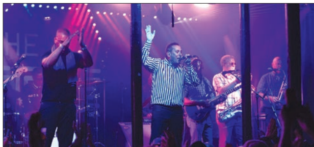
The Specials LTD coming to the Marine Theatre in Lyme Regis

THE Marine Theatre at Lyme Regis celebrates the 45th anniversary of the release of Too Much Too Young , when the Specials Ltd come to the venue on Saturday 15th March, re-creating the energy and enthusiasm of the legendary two-tone and ska band that formed in Coventry in 1977.