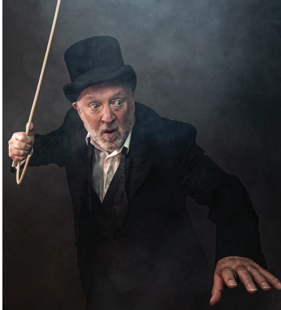
The Ghost of a Smile will visit villages around the area in March

"For me as a writer, to hear the words lifted