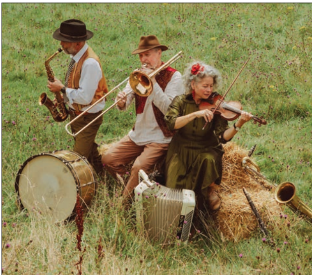
Jaclarabag coming to Dorset in March

Artsreach is bringing them Dorset in March.