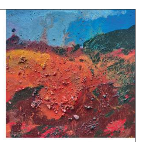
Frances Hatch ARWS Holly Sentinel 27 x 27cm acrylic and earths on board

SLADERS YARD Contemporary Art & Craft Gallery West Bay DT6 4EL @sladersyard t: 01308 459511 e: gallery@sladersyard.co.uk Weds - Sun* 10am - 4pm www.sladersyard.co.uk