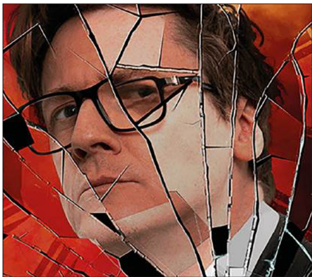
Ed Byrne coming to Poole and Weymouth

A QUOTE famously attributed to Mark Twain provides the title for Ed Byrne's current tour, which is coming to Poole Lighthouse Theatre on Thursday 16th January and Weymouth Pavilion on Sunday 19th.