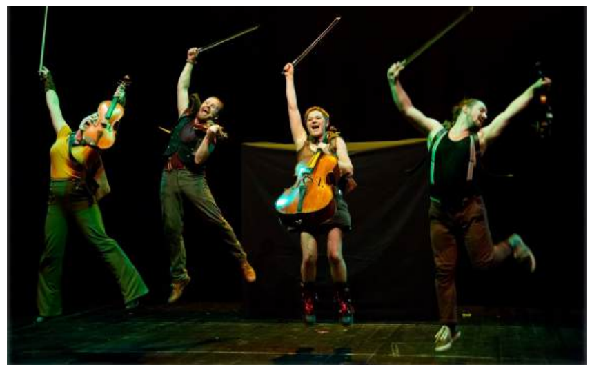
Bowjangles—‘an irreverent, anarchic group of genre-spanners’

IF you think a chamber ensemble is all about serious string quartets and solemn musical introductions, you haven't met Bowjangles. This is the quartet that puts the swing into strings—and they are back in Dorset for concerts at Litton Cheney community hall on Thursday 23rd January,