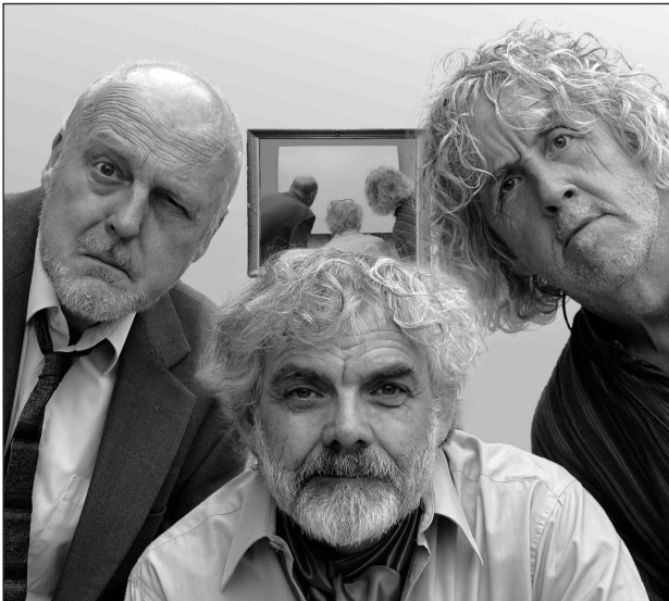
Somerleigh Players coming to Dorchester Corn Exchange

ONE of the most successful plays of the last 30 years is also one of the most contentious. Some people think it is utterly hilarious—others don't. Indeed, it has a contentious subject— ART asks the basic question, Is it ART? Somerleigh Players will be performing Yasmina Reza's hit comedy at Dorchester Corn Exchange on Thursday 9th and Friday 10th January at 7.30pm.