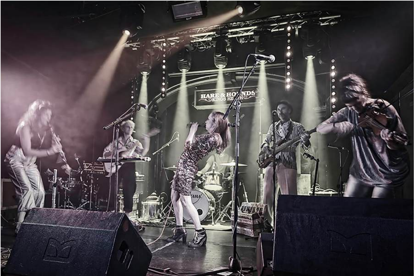
Bonfire Radicals coming to Drimpton and Portland

The line-up for the evening will feature two additional comedians, ensuring an evening filled with laughter and entertainment.