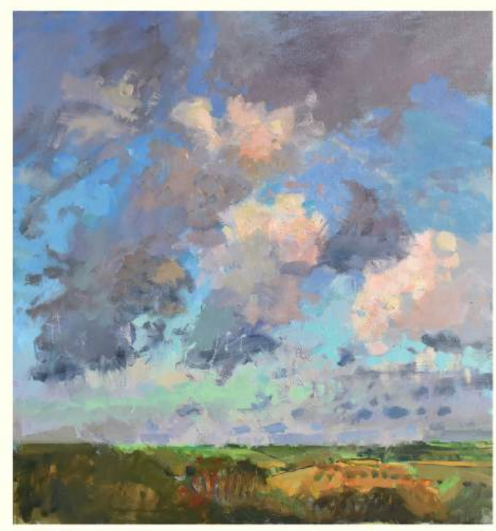
ABOVE ABBOTSBURY, EVENING SKY