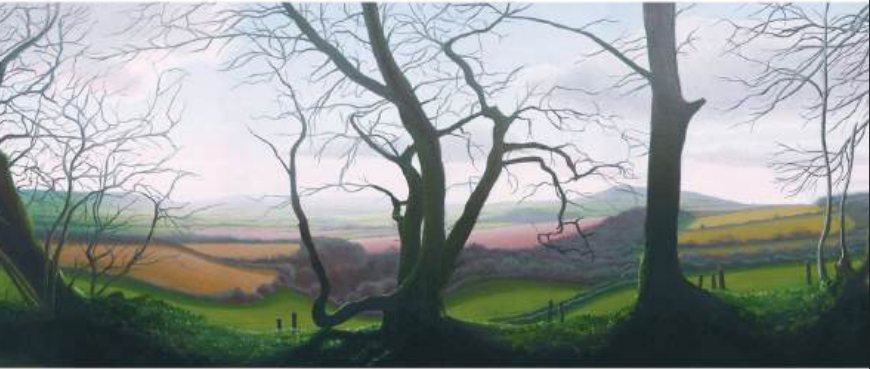
A VIEW FROM LEWESDON HILL OIL ON CANVAS 140x60CM