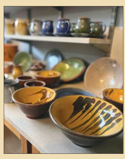
Ceramics at Bridport Arts Centre, Bridport