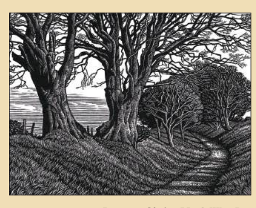
Prints at Sladers Yard, West Bay