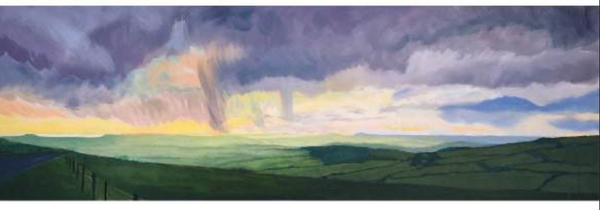
RAIN & STORMS OVER EGGARDON HILL OIL ON CANVAS 180x60CM

KIT GLAISYER FINE ART 11 DOWNES STREET BRIDPORT DT6 3JR