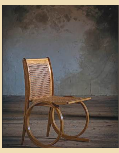
Furniture at Sladers Yard, West Bay