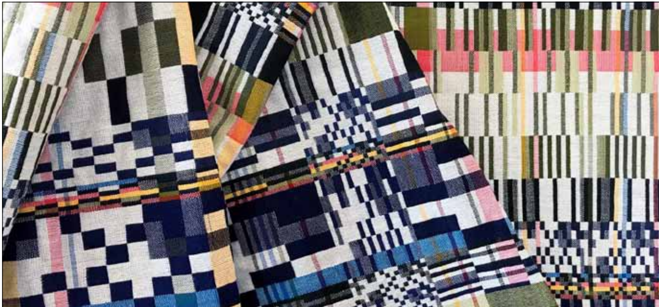
seam collective: A Visible Thread in Honiton from July 20

I thought, it's time." The Malthouse Gallery, East Lambrook Manor Gardens, East Lambrook, Somerset TA13 5HH Tuesday - Saturday, 10am - 5pm, www.eastlambrook.com Entry free.