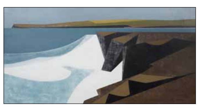
Vanessa Gardiner White Coast (Orkney) acrylic on plywood, 60x122cm

Clean lines, dynamic surfaces and thrilling coastal subject matter are defining features of all three of the artists in this new Slader's Yard exhibition at West Bay.